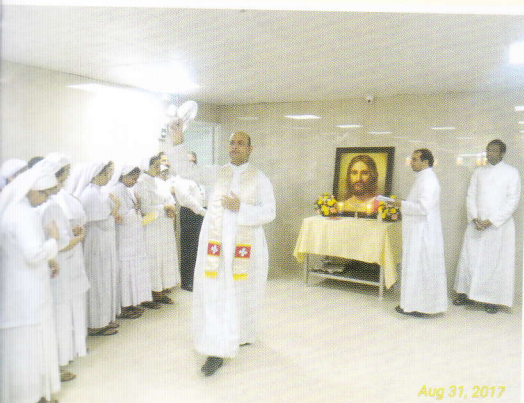
Aug 31, 2017