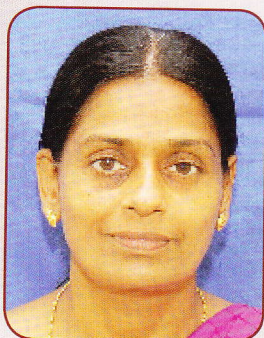
Kochurani P.O July 2017 (Receptionist)