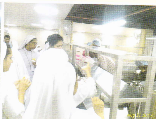
Aug 31, 2017