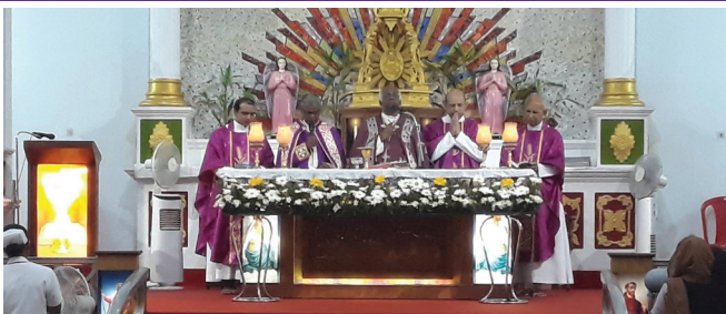
Special Mass on the Founder's Day at Lisie Hospital