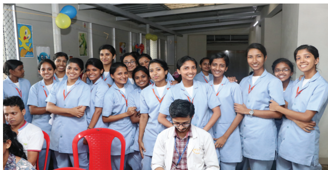
Medical camp @ Naval Aircraft Yard, Cochin